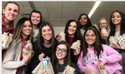
Future SLPs creating blessing bags