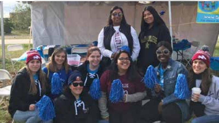
October 2018 Autism Speaks Walk