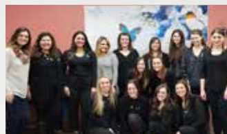
MS SLP and MS CMHC students and faculty at this year's culminating performance of The Gift