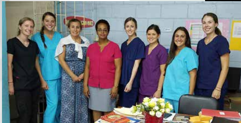
Medical Mission Trip Fall 2017