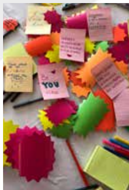
Inspirational quotes for blessing bags for Long Island Coalition for the Homeless Health and Resource Fair

Serving the community through inter-professional collaboration in education, research and practice