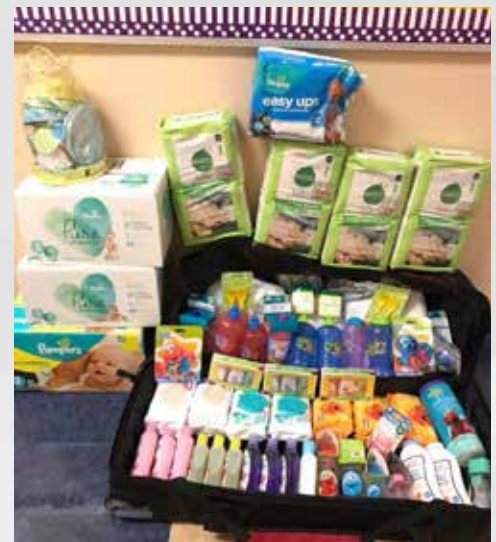
Some of the materials donated