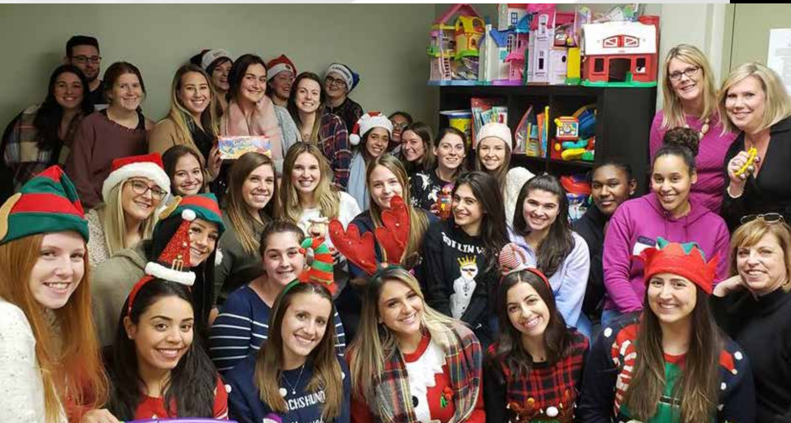
Holiday Cheer from CSD December of 2018