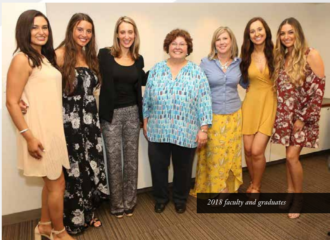
2018 faculty and graduates