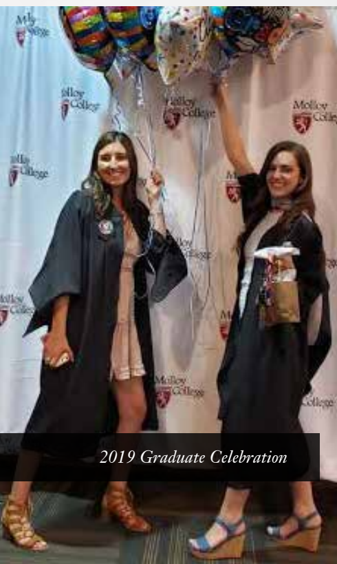
2019 Graduate Celebration