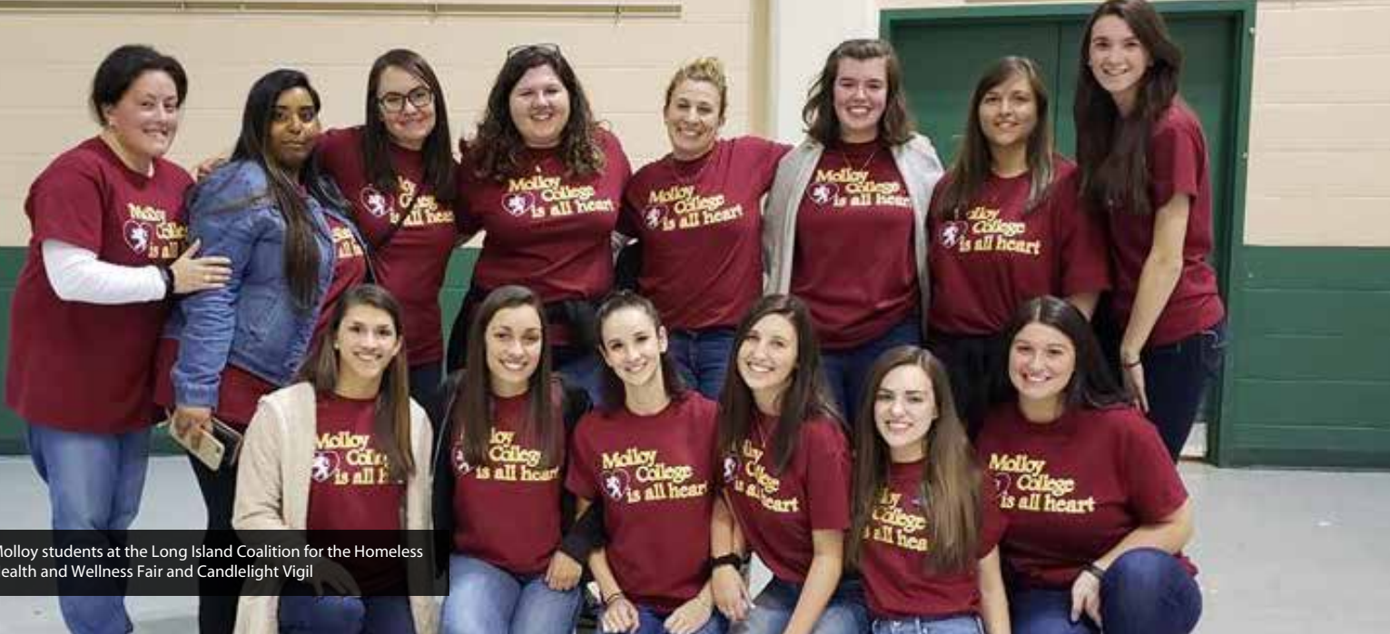
Molloy students at the Long Island Coalition for the Homeless Health and Wellness Fair and Candlelight Vigil