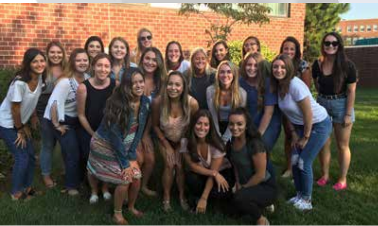
Welcome Back Cohort 1 Fall 2018