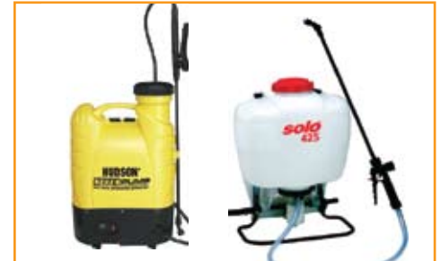
HUDSON AND SOLO PUMP TYPE SPRAYERS

The application process requires a basic pump sprayer (two common brands are Hudson and Solo) or hose-