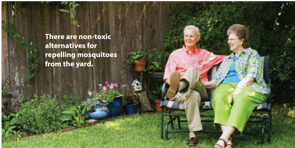
There are non-toxic alternatives for repelling mosquitoes from the yard.

It is very common for people to ask if the yard will smell like garlic. Generally, humans only notice the smell for a few hours after application. Mosquitoes, however, have a very powerful sense of smell and find it overpowering, which causes them head in another direction.